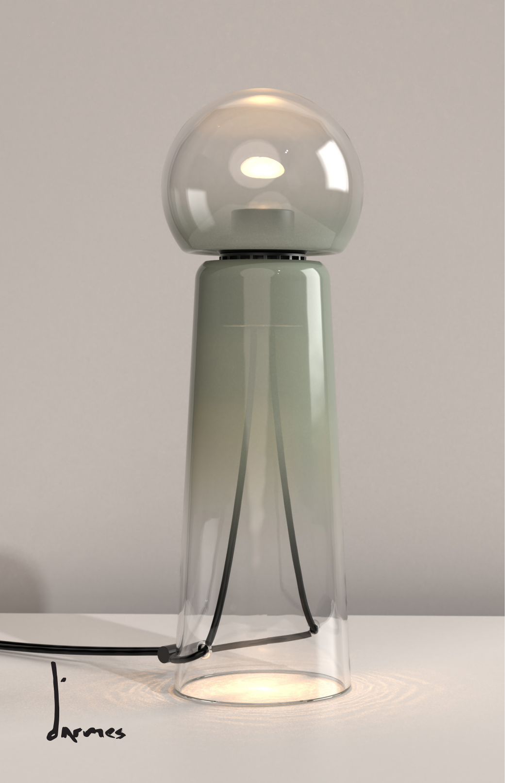
Table lamp Gigi

Gigi is playful. Its lines are daring and its tones sensual. Under the breath of the glassblower, the unique shades and tones of the color spread throughout the material. It allows itself to be discovered, to be revealed in alternating opacity and transparency.