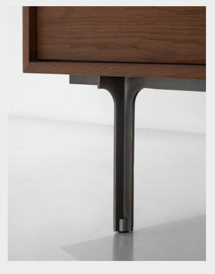
Oak frame / Antique nickel / Leather handles

Tote is a collection of cabinets, credenzas, dressers and tallboys, streamlined in form and function, with drawers and/or doors crafted in District Eight's signature materials of oak. Subtlety for details is highlighted upon the evenly contrasted steel legs, while the highlight awaits in Tote's hand-crafted handles – outfitted in high-quality leather, they provide tactile pleasure and warmth upon touch.