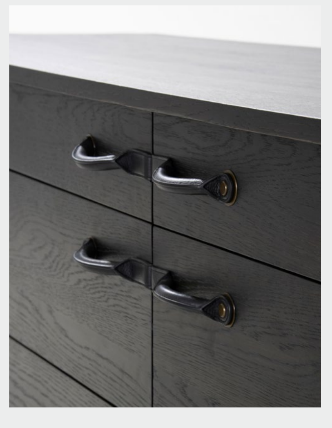
Oak frame / Antique nickel / Leather handles

Tote is a collection of cabinets, credenzas, dressers and tallboys, streamlined in form and function, with drawers and/or doors crafted in District Eight's signature materials of oak. Subtlety for details is highlighted upon the evenly contrasted steel legs, while the highlight awaits in Tote's hand-crafted handles – outfitted in high-quality leather, they provide tactile pleasure and warmth upon touch.