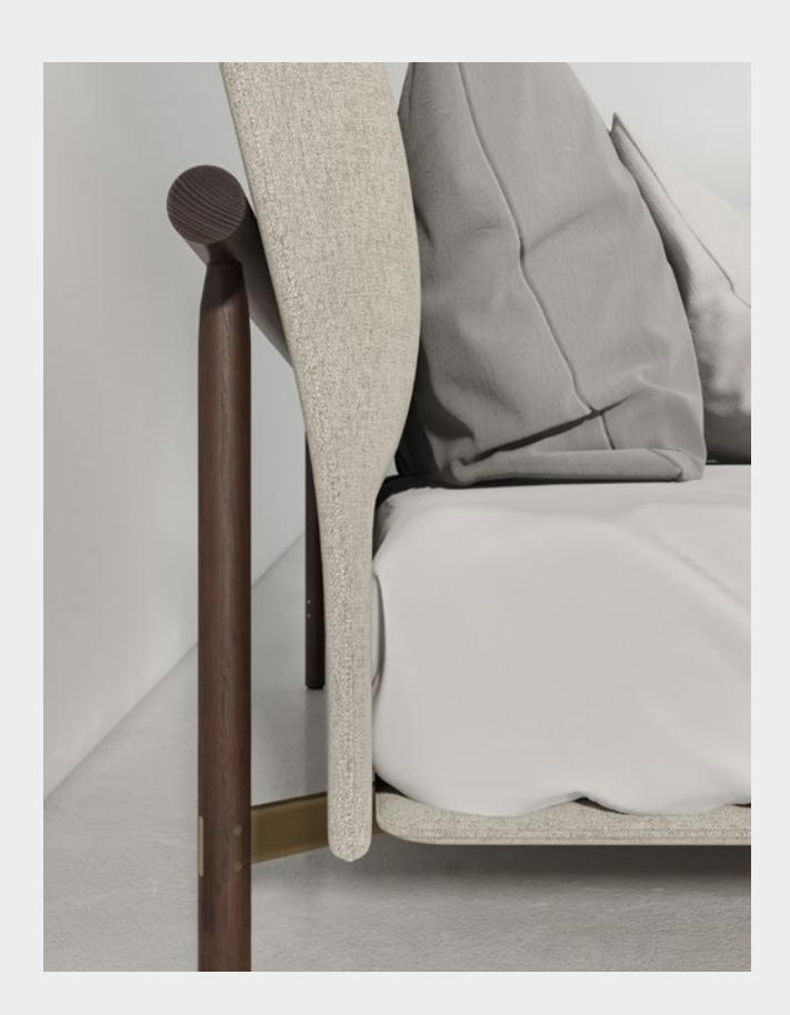
Oak frame / Steel structure / Upholstered head board & platform