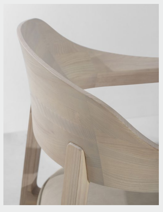
Ash frame / Upholstered seat

Collette Chair offers an abstract reference to the Vietnamese traditional script and a love letter to the craftsmanship of timber. Its sweeping backrest forms a collar that's instantly distinctive and inviting. Extended to ridges of the armrests and their rounded ends, the frame provides ample support for ease and comfort, lending the collection a level of formality and sophistication in any space.