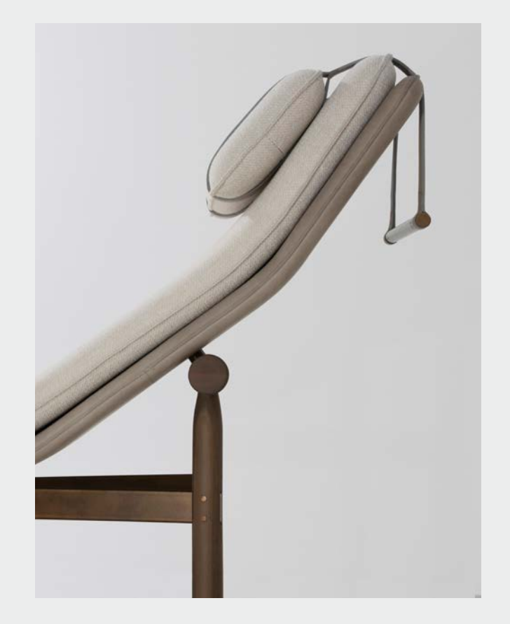
Oak frame / Steel structure / Upholstered platform & cushion