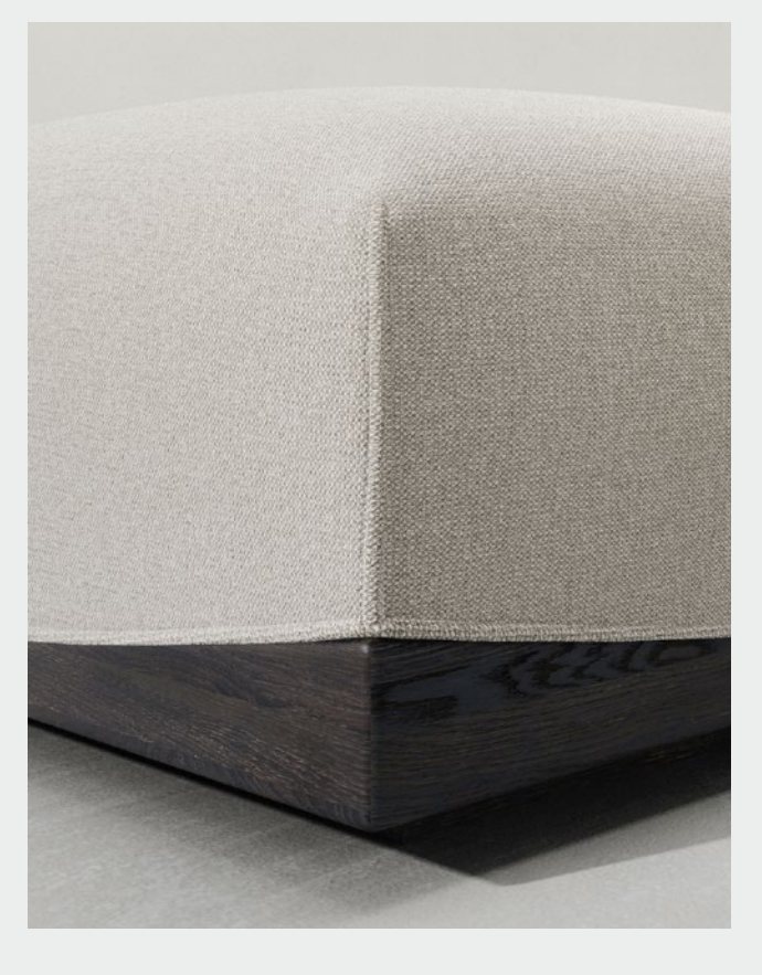
Oak frame / Upholstered seat

A sofa collection of monolithic stature, Joss is a contemporary statement in harmony and serenity. Characterized by an upper curvature, the design's solid wood base pays homage to elements of traditional roofs found in Southeast Asian architecture. While the curved lines mirrored in generous foam seats, backrests and armrests emphasize comfort in exceptional volumes and upholstery.