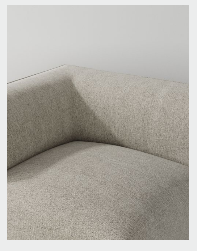
Oak frame / Upholstered seat

A sofa collection of monolithic stature, Joss is a contemporary statement in harmony and serenity. Characterized by an upper curvature, the design's solid wood base pays homage to elements of traditional roofs found in Southeast Asian architecture. While the curved lines mirrored in generous foam seats, backrests and armrests emphasize comfort in exceptional volumes and upholstery.