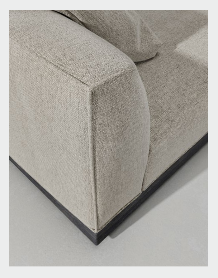
Oak frame / Upholstered seat

A sofa collection of monolithic stature, Joss is a contemporary statement in harmony and serenity. Characterized by an upper curvature, the design's solid wood base pays homage to elements of traditional roofs found in Southeast Asian architecture. While the curved lines mirrored in generous foam seats, backrests and armrests emphasize comfort in exceptional volumes and upholstery.