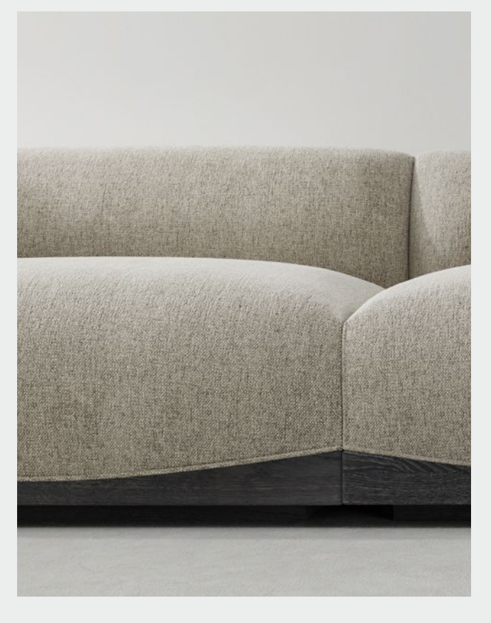
Oak frame / Upholstered seat

A sofa collection of monolithic stature, Joss is a contemporary statement in harmony and serenity. Characterized by an upper curvature, the design's solid wood base pays homage to elements of traditional roofs found in Southeast Asian architecture. While the curved lines mirrored in generous foam seats, backrests and armrests emphasize comfort in exceptional volumes and upholstery.