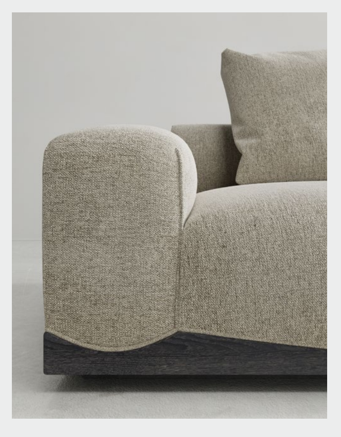
Oak frame / Upholstered seat

A sofa collection of monolithic stature, Joss is a contemporary statement in harmony and serenity. Characterized by an upper curvature, the design's solid wood base pays homage to elements of traditional roofs found in Southeast Asian architecture. While the curved lines mirrored in generous foam seats, backrests and armrests emphasize comfort in exceptional volumes and upholstery.