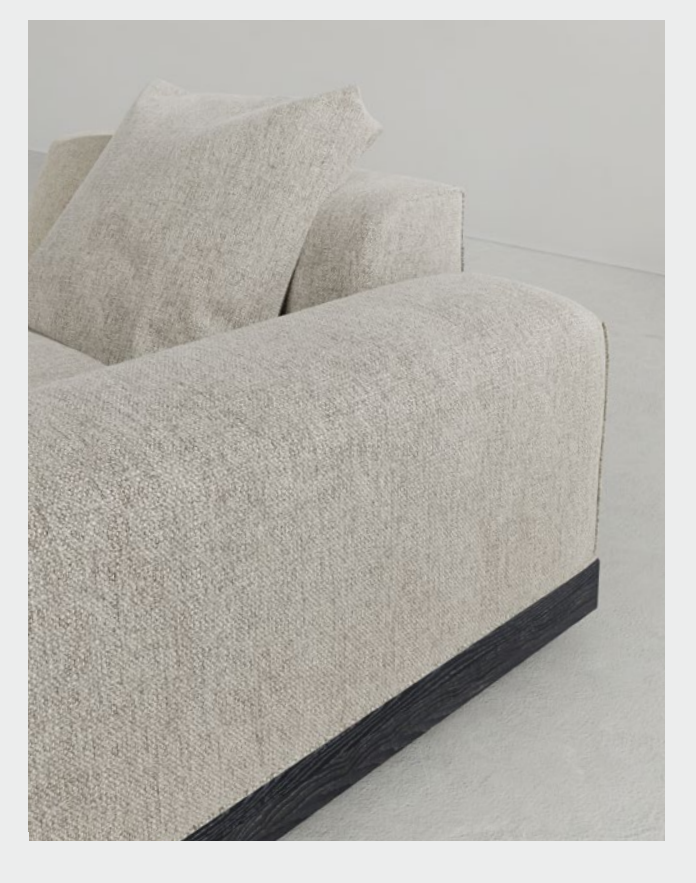
Oak frame / Upholstered seat

A sofa collection of monolithic stature, Joss is a contemporary statement in harmony and serenity. Characterized by an upper curvature, the design's solid wood base pays homage to elements of traditional roofs found in Southeast Asian architecture. While the curved lines mirrored in generous foam seats, backrests and armrests emphasize comfort in exceptional volumes and upholstery.